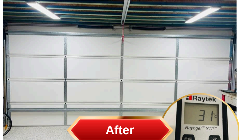
Insulated with ThermaDoor